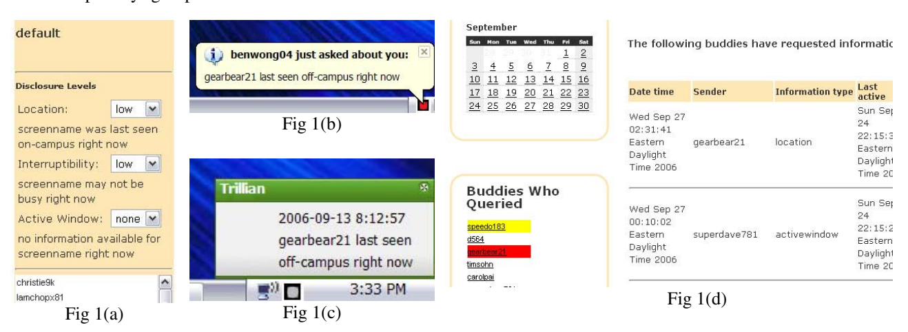
Figure 1. These screenshots show the control and feedback mechanisms of imbuddy411. The configuration user interface (a) shows what information will be disclosed by default. A notification (b) lets users known when someone is requesting information. A grounding and social translucency mechanism (c) lets a user know what the other person knows, and is shown at the start of a conversation. A disclosure history (d) lets people audit disclosures.

More importantly, although all our participants agreed that the three information types being disclosed were all potentially sensitive (interruptibility: 3.6, location: 4.1, active window: 4.9, all out of 5), our