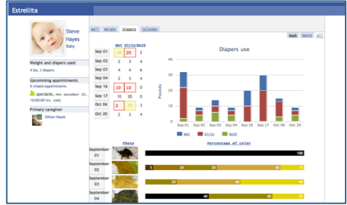
Figure 1. (left) Overview screen for the Estrellita mobile application; (middle, right) Estrellita website screenshots

Weight: Healthcare professionals interviewed all indicated that weight has a strong correlation to the baby's health and, in particular, they would be concerned if even a week passed without the baby gaining weight. However, many clinicians also raised concerns about parents dwelling too much on day-to-day weight fluctuations. Thus, systems designed to support collection of weight data for preterm infants must provide guidance around the appropriate frequency of such data collection as well as visualizations that help smooth or hide the kind of daily fluctuations that might cause unnecessary concern. Estrellita prompts parents to record weight data once per week and will not allow more frequent input of this element than that. When parents record these data, they are also required to take a picture of the infant on the scale. Thus, if major fluctuations are seen, a provider can review these images to ensure the