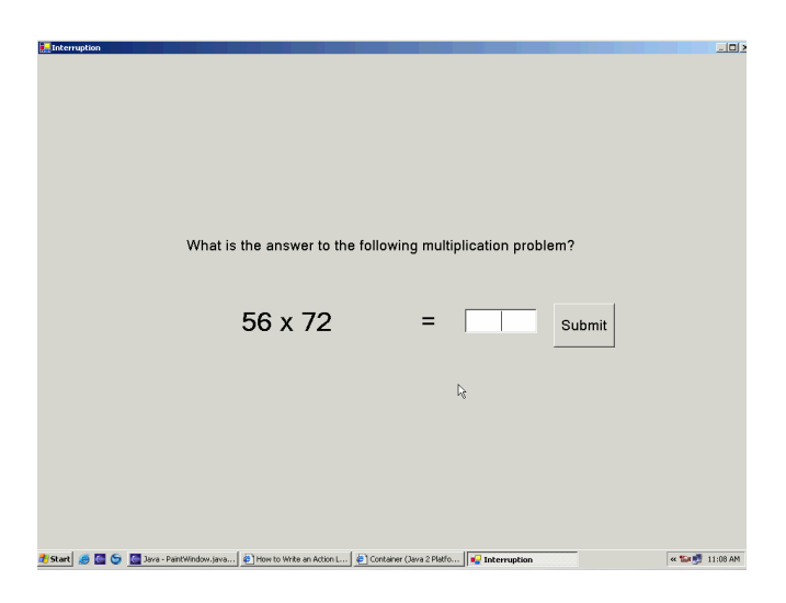
Figure 3. A mental arithmetic interruption. Note that it obscures the entire screen.

icon shown in Figure 2 notified participants of a pending interruption. Participants could choose whether to address it immediately or continue with their primary programming task until they wanted to address the interruption. In his work on techniques for coordinating interruptions, McFarlane refers to this approach as a negotiated solution, because a person is able to choose when they want to McFarlane found that this address an interruption. negotiated solution generally works best, as long as small differences in the time taken to begin addressing an interruption are not critical [21]. Robertson et al. have compared immediate and negotiated coordination of error messages when programming in a spreadsheet application, finding that task performance was significantly better with negotiated coordination [24]. This evidence that negotiated coordination is the best approach to interruptions in development environments informed our use of negotiated coordination, as we want our study to be based in how programmers handle normal interruptions. associated with the interruptions by telling participants that they would lose $2 for any ignored or incorrectly answered interruption, but we did not enforce this penalty.