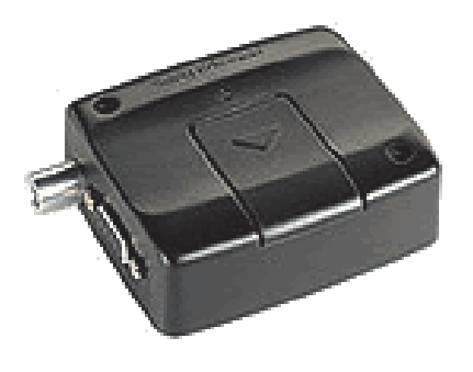
Figure 1. GM28 Sony Ericsson Modem